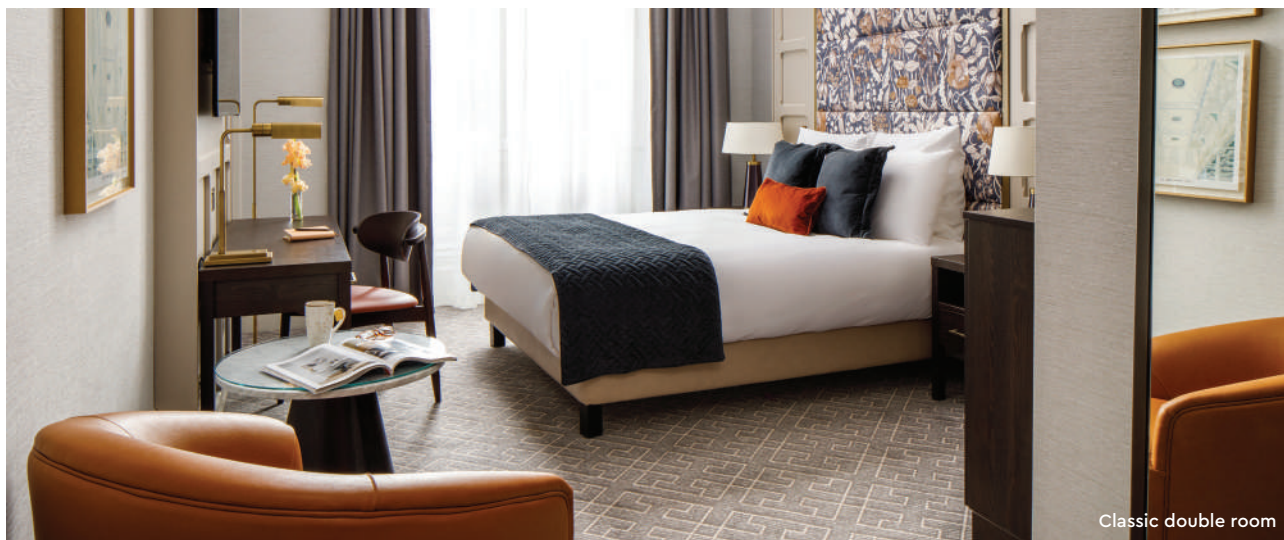
Classic double room

Every detail in the luxury bedroom have been thoughtfully curated to create a space that is both incredibly stylish and exceptionally comfortable, providing an exquisite retreat from the City of Liverpool.